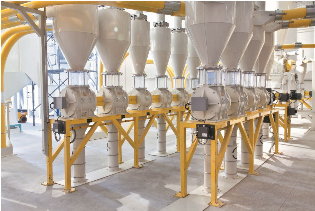
Caption: Among other things, Olocco is a specialist in rotary valves for receiving raw grains in a milling process for obtaining wheat flour.